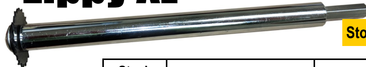
Stock Code #152