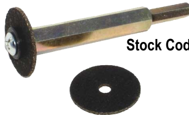
Stock Code #192