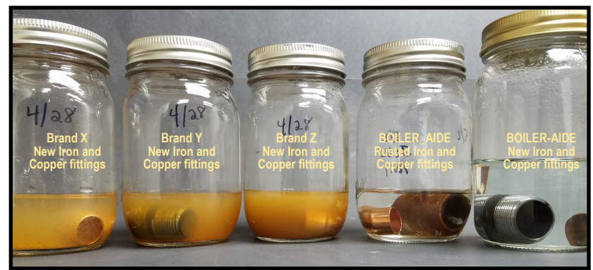
BOILER-AIDE outperforms the competition. After one week diluted to 0.6%.

BOILER-AIDE 2-N-1 All Purpose Boiler Cleaner and Treatment - A premium liquid boiler treatment with special anti-corrosion inhibitors used in all steam and hot water boilers. Protects boiler systems from corrosion, scale formation, and bacterial growth. This superior boiler water treatment removes sludge, mineral deposits, and inhibits corrosion on all metal surfaces inside the boiler and pipes. Prevents oxygen pitting and formation of lime scale; eliminates surging and foaming and controls pH of boiler water. BOILER-AIDE helps in increasing boiler efficiency and decreasing fuel consumption. Free from petroleum distillates and is compatible with seals and gaskets.